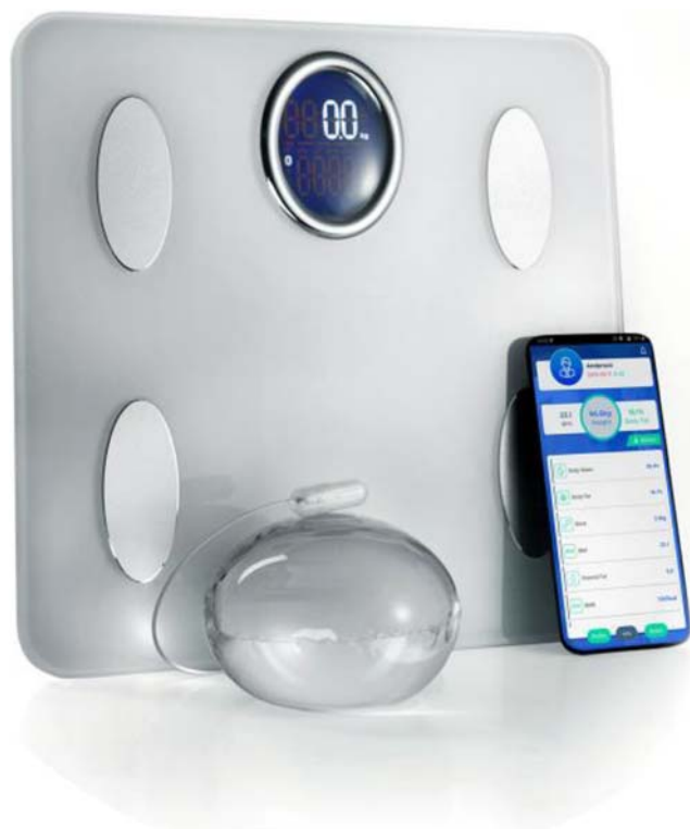
Fig. 4 The Elipse system: Elipse balloon, Bluetooth® body composition scale, and smartphone app for virtual follow-up

The Elipse balloon was placed in 1770 overweight and obese patients (F 1264/M 506) at 19 international obesity centers of excellence (Table 1). During the Elipse program, the patients were closely followed by a dedicated multidisciplinary team. The program commenced 2 weeks prior to balloon placement and continued until balloon passage at approximately 4 months. Prior to placement, a detailed medical obesity history, nutritional behavior history, and anthropometric evaluation (height, weight, BMI, circumference of waist) were performed. Laboratory values were