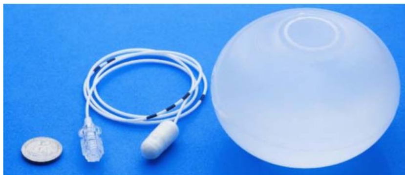
Fig. 1 The Elipse® balloon

For each endpoint, subset analysis was performed by gender and BMI ( \text{kg}/\text{m}^2 ) ( < 30 , 30 to 40 , and > 40 ).